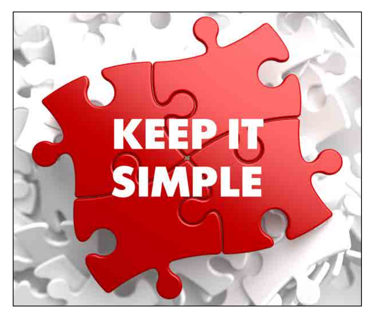
"I have had this phobia all of my life, you cannot get rid of it in minutes"

"Well I feel fine now but I know it will come back later" or