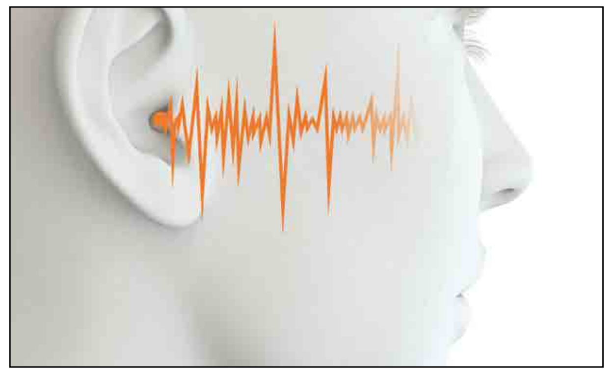
'There are a large variety of approaches and techniques, which might well be used in treating tinnitus and the following outline will hopefully provide an insight into the key methods that might be used.'

The Hadassah hospital referred to at the beginning of this paper lets its tinnitus patients know before they attend that they must consider staying in the local area for four to five weeks for treatment. This may not be a feasible plan in most situations but it underlines the commitment and investment in time, which is required by both patient and therapist in treating tinnitus. Although clients of mine have 'lost' their tinnitus after as short a number of sessions as six, most clients will need to understand from the outset that treatment will probably take time, certainly months rather than weeks and maybe a year or more although that is not common.