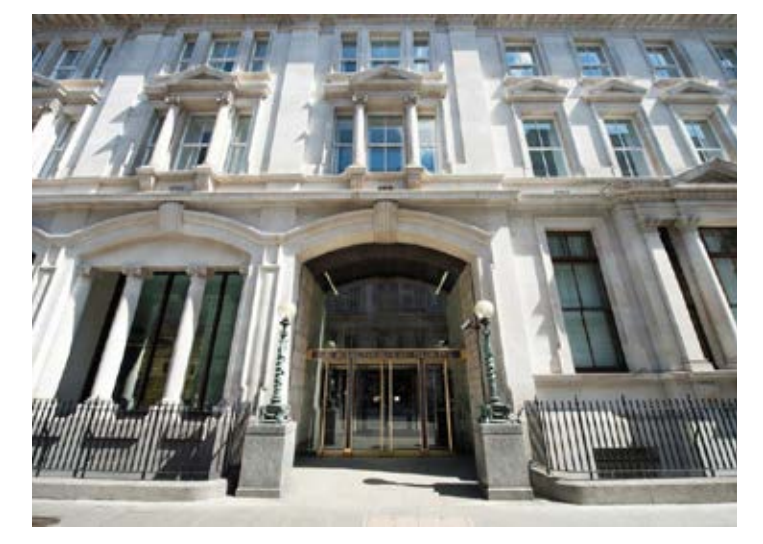
The Royal Society of Medicine, 1 Wimpole Street, London

Aside from an exciting line-up of internationally-renowned speakers, our yearly one-day event is a great opportunity to mingle with colleagues, meet some new ones, and really share and expand your knowledge. You will receive a 7-hour CPD certificate for your attendance, contribute valuable input to your Annual General Meeting, alongside plenty of opportunities to meet with NCH Directors and all of the support staff that keep the National Council for Hypnotherapy moving forward. Please purchase your tickets as they are selling very fast - our speaker line-up this year is nothing short of extraordinary!